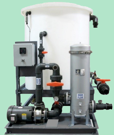
Close up of Clean-In-Place Components